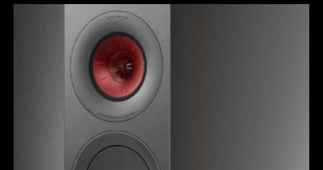
Titanium Gloss Special Edition (Exclusive for R7 Meta)