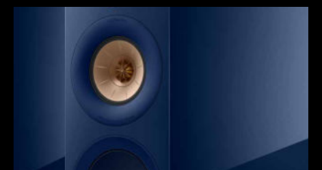
Indigo Gloss Special Edition (Exclusive for R3 Meta)