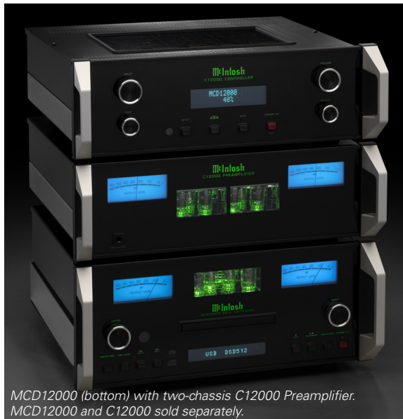
MCD12000 (bottom) with two-chassis C12000 Preamplifier. MCD12000 and C12000 sold separately.

In order to ensure the highest level of customer satisfaction, new McIntosh products may only be purchased from an Authorized McIntosh Dealer; and, with certain limited exceptions may only be purchased over-the-counter or delivered and installed by the Authorized McIntosh Dealer. McIntosh does not warrant, in any way, products that are purchased from anyone who is not an Authorized McIntosh Dealer, or that have had their serial numbers altered or defaced.