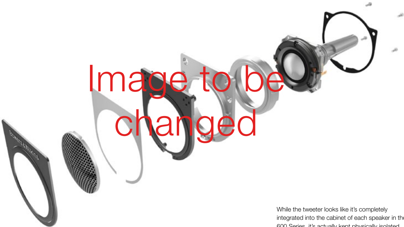
Image to be changed

When designing a tweeter, the goal is to make the diaphragm light yet stiff to reproduce high notes accurately with a pistonic back-and-forth motion and minimal distortion. The 600 Series does this beautifully, borrowing high-end tweeter technology from Bowers & Wilkins award-winning CM10 speaker. Its double dome design uses an extremely thin aluminium dome for lightness, surrounded by a thicker aluminium ring for rigidity; these combine to stop the voice coil from distorting. The result is a treble performance so pure and precise it will take your breath away.